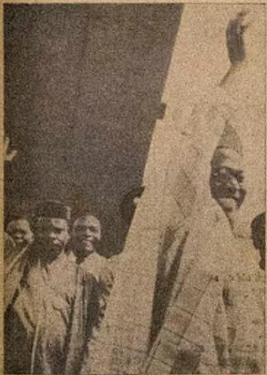
Awon Oloye Awolowo ati Akran ti nwon se asiwaju ninu irin ajo na ni awon njuwo si awon ero ti o wa pade won ni Ikeja yi.