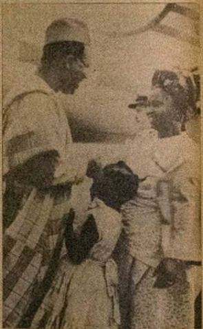
Ima igarso Gloje Awolowo dun lati tun ba oke to pada, awon ba ara won loru pely idanwo, omo won si to mo babo re.