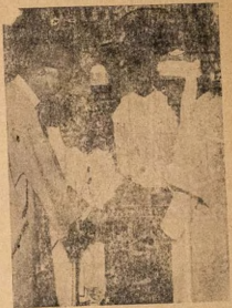
Aworan oke yi je eyin o se apere da adara kan nipa oro kan ti nwon ma spa lase wipe ohun gbogbo ki iri bi a ti ro won si, nitari awon omo ile Nigeria ti nwon urerin musen ninu aworan yi ngn dawo lau wo jau kebode daradara kan wo, nwon si tun oje jikun aramonda kan wo ninu ile ero Radio ni ilu oyinbo, awon a ma lo ariwo si si tabi un ilkun na fun ikede tabi ere kan.

Lese kanna ni nwon ba mu lo si ile awon alaisan nla ni Eko fun ayewo, sugbon kawi ka fo, o ku bamubamu ni ojo na.