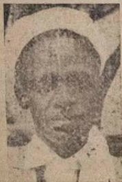
Alhaji Yusuf Maitama Sule, Minister of Mines & Power

LAGOS, APAPA & EBUTE METTA, IBADAN, KADUNA, KANO, JOS, ENUGU, ONITSHA, PORT-HARCOURT & ABA.