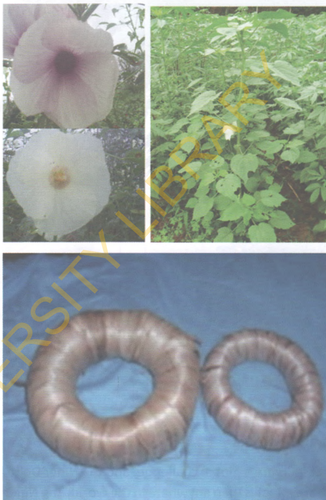
Figure 1. Kenaf Plant and flowers

Kenaf ( Hibiscus cannabinus ) plant are effective in achieving this. Kenaf fibre is non-toxic, nonabrasive and is more effective than classical remediants, like clay and silica. In the U.S, India, China, and Australia, Kenaf is an industrial crop used for acoustic tiles, automobile industries, animal bedding, vegetable and fuelwood. Besides, it is also used as an absorbent.