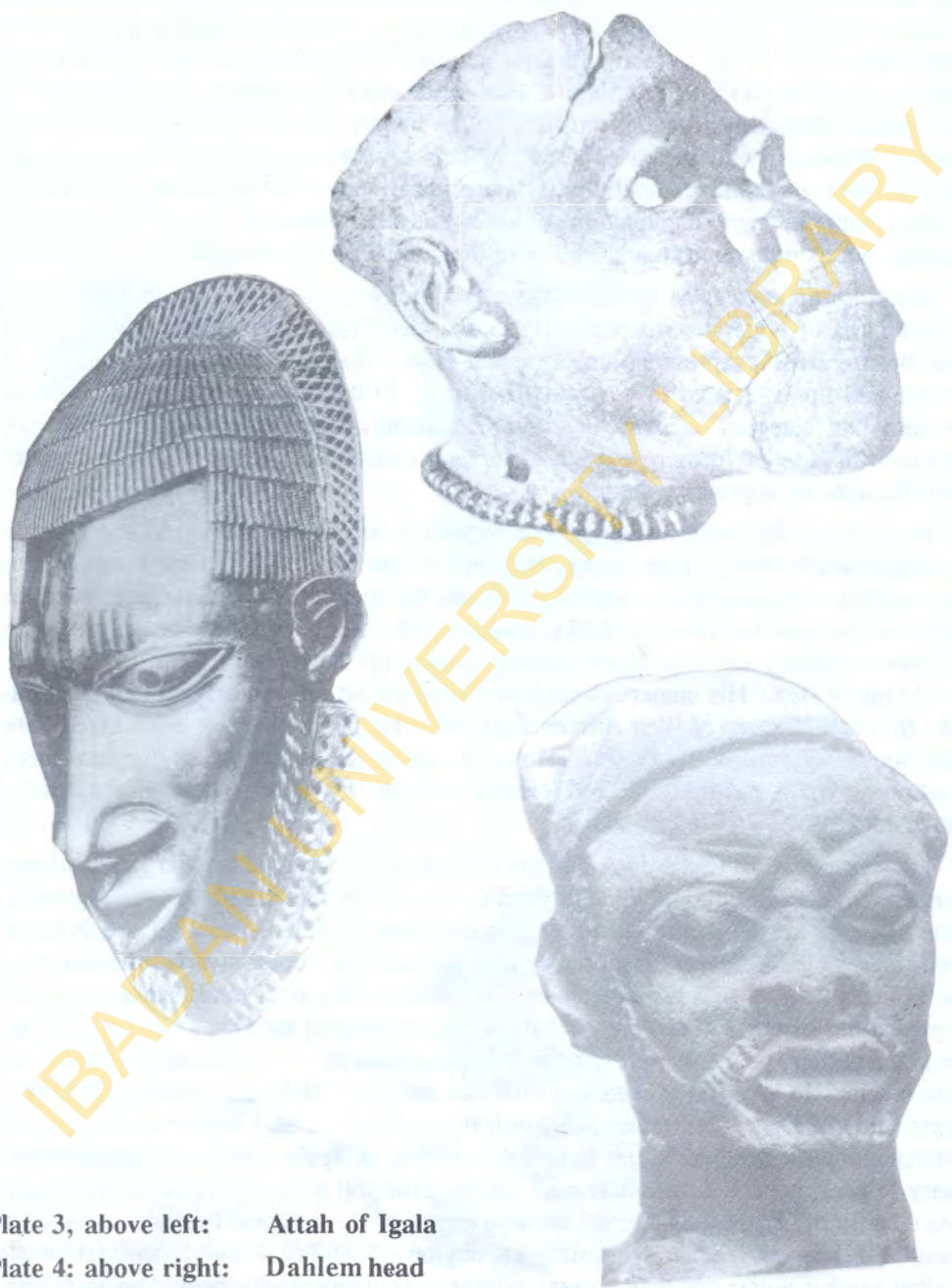
Plate 3, above left: Attah of Igala Plate 4: above right: Dahlem head Plate 5: right: man from Owo