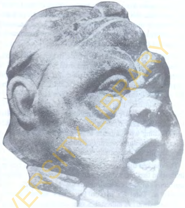
Terracotta head from Obalara's land, Ife

In his study of the representation of ears in Benin and Ife art, Willett (1967: 162-163) points out at least eight different types from both cultures. Of the eight types, the first two, which incidentally are from Ife, are the most naturalistic. The other six represent details of ears as they are represented in the various artistic periods of Benin art (Fagg, 1963). It is intriguing to note that the ears of dwarf A share a very close