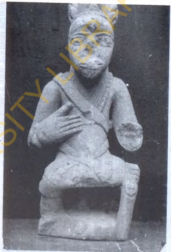
Plate 4: A stylized image from Esie. It is represented as a Warrior with a quiver on its back. (National Museum, Esie).(Right)