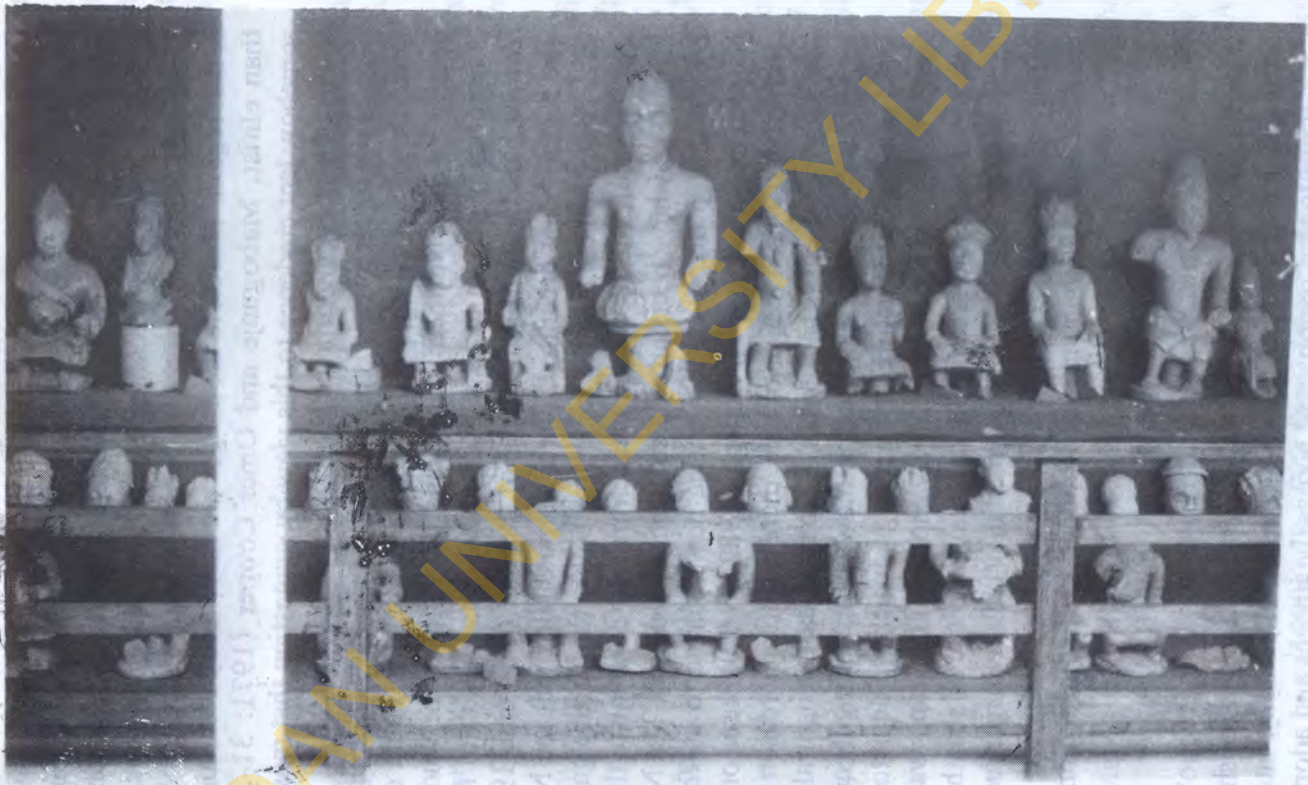
Plate 6: Another aberrant figure from Esie. This picture illustrates the size difference between it and the others in Esie (National Museum, Esie).