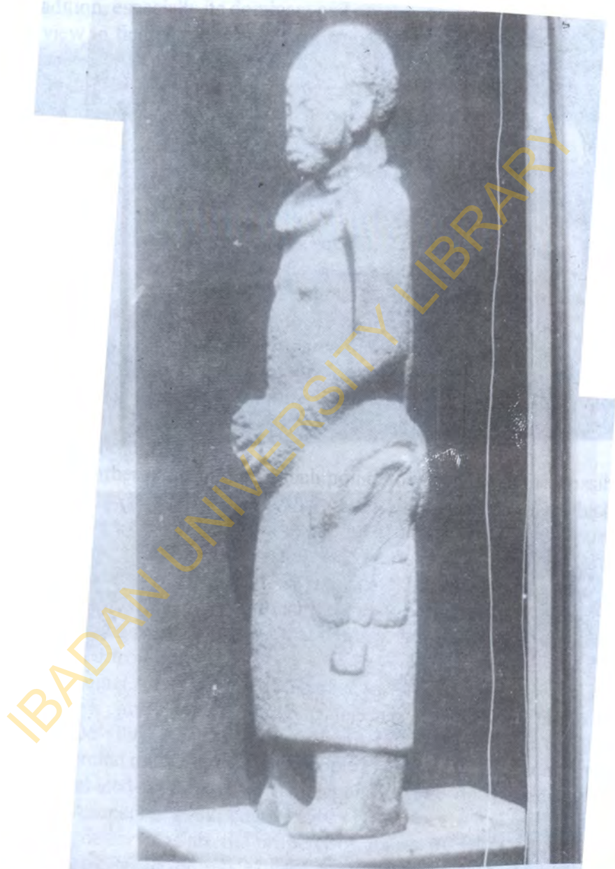
Plate 2: Figure of Idena discovered in Ore grove, Ife (National Museum, Lagos)