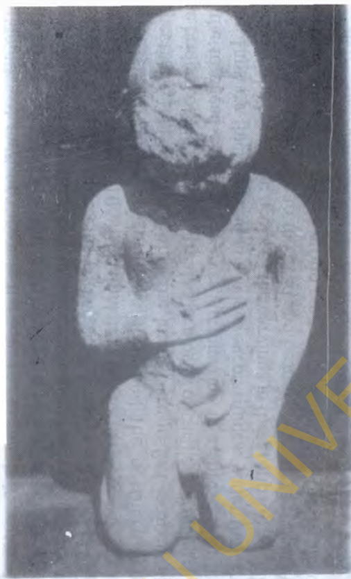
Plate 3: The figure of a kneeling naked man, Esie. It also represents the naturalistic style in Esie. (National Museum, Esie)(Left).