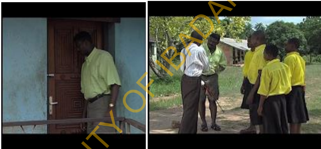
Yinka on a surprise visit to his wife at Oleyo

The poor communication between the couple leads to a lot of gradual conflicts in the film. Ngozi is a young and extremely beautiful woman this makes Yinka believe that she will not stay away from other men. Hence, Yinka becomes jealous as he listens to what his friends tell him about his wife. He stops attending to his wife in bed, even when Ngozi's landlady buys him Odeku (an energy drink) to make him perform and forget all the accusations against Ngozi when he visits her at Oleyo. At first, she tells him about her decision to stop working but he asks her to forgive him for suspecting and accusing her of infidelity.